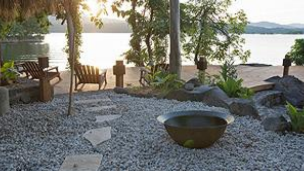
Three nights at Jicaro Island Ecolodge in a Casita on a Full Board Basis