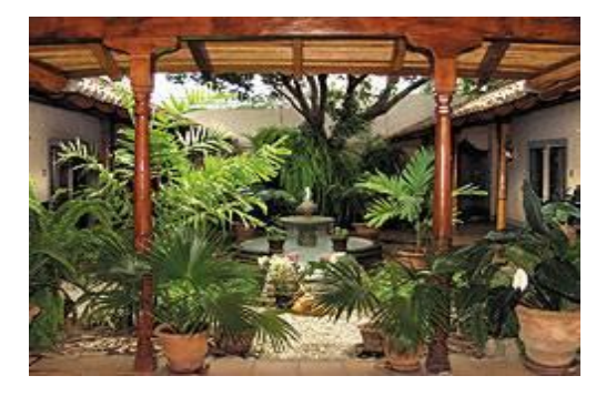
One night at Los Robles in a double room including breakfast