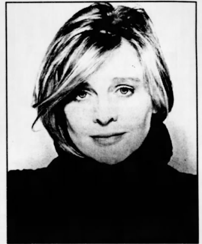
● Julie Christie

● Suzanna Adler continues at the Yvonne Arnaud until Saturday.