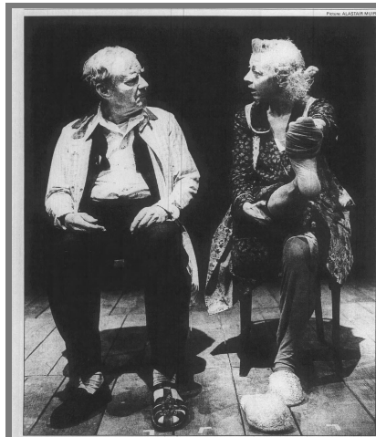
Outlandish spectacle: Richard Briers and Geraldine McEwan as the old couple in Ionesco's The Chairs