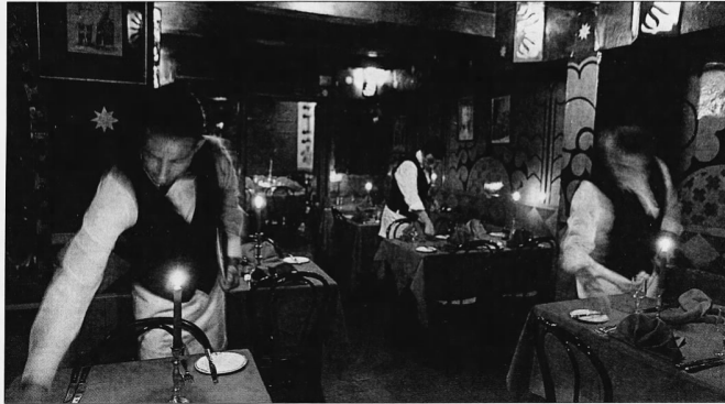
"Quite simply, a terrific restaurant": Nikita's has limitless food, friendly service and reasonable prices

F ROM the utterly ridiculous to the totally sublime, when it comes to Russian food, a thankfully short journey — about four miles, in fact, from Portland Place to Fulham — home of that little gem NIKITA'S. The very moment you enter the bar upstairs, to be greeted by a friendly face and good balalaika music, the soul, ravaged by the Tsar Bar, begins to be refreshed. The downstairs area, where the eating takes place, is small, unusually pretty and a touch Bohemian in aura: the ornate wallpaper comes in rich blacks, pinks and bordeaux reds, the antique lights have spider markings, and the lighting is predominantly by candle. The tables are few (it seats only 35), but there are a couple of tables private, which are great for private parties.